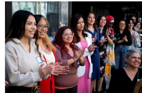
Graduates clap for the first-ever Colibri Fellowship class on May 26. The fellowship is an eight-month program providing Department of Justice accreditation through the Immigrant Justice Leadership Academy at The Resurrection Project.

Fellowship trains them to represent residents without legal status