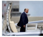
Donald Trump arrives Monday at Miami International Airport ahead of his federal court appearance.

Trump returns to Florida as he and allies call for protests