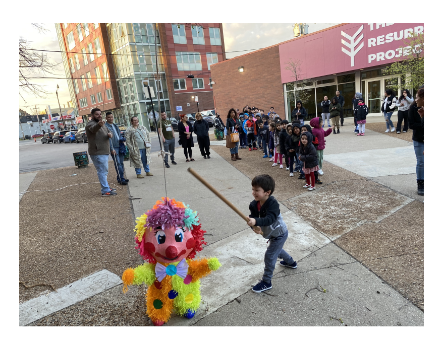
CELEBRATING EL DIA DEL NIÑO

and the Chicago Police Department-CAPS gathered for a free community event with resources on mental health on Saturday , April 22 , 2023 . More than 109 community residents enjoyed the event. See the events section for information on the next mental health fair.